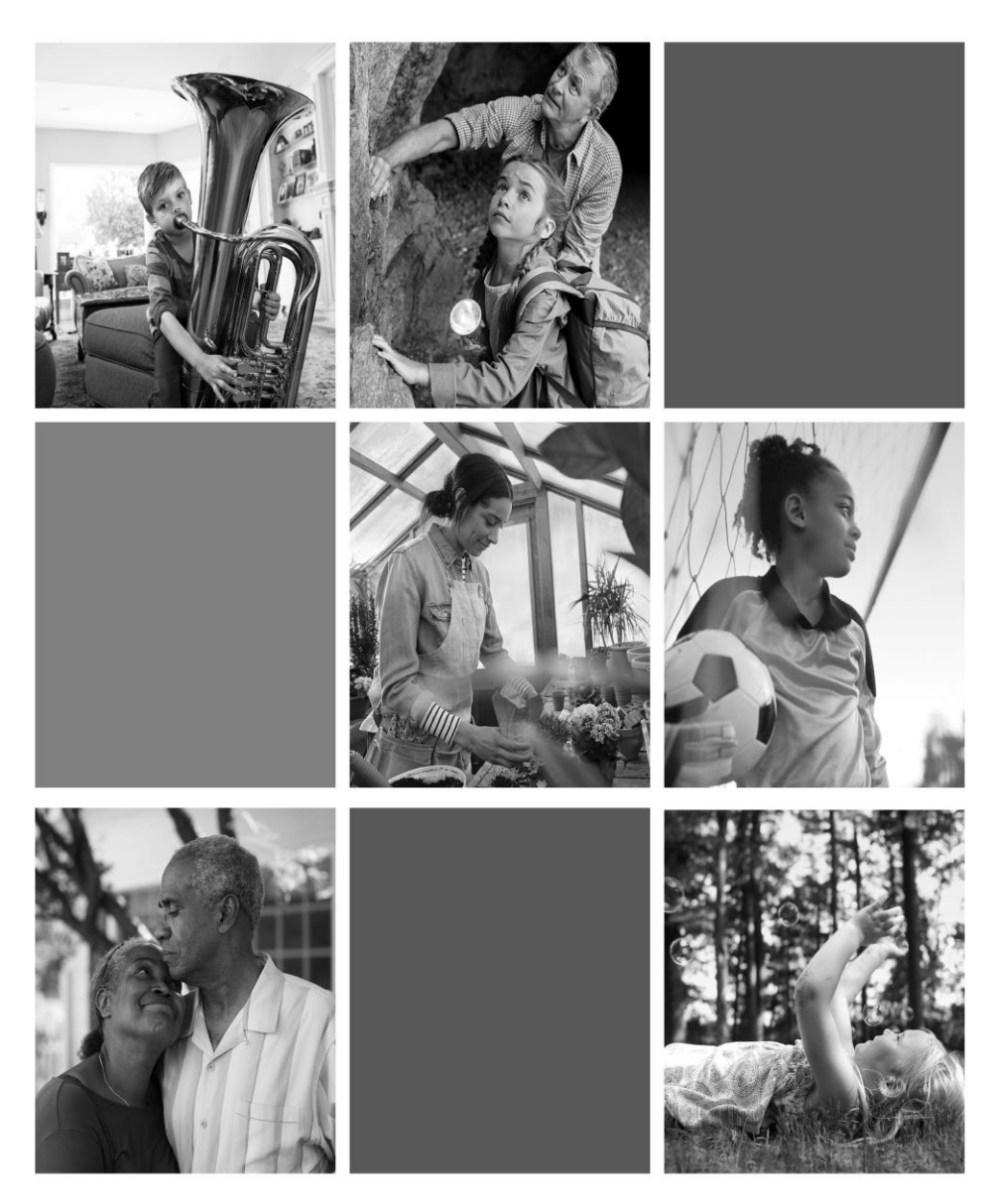
Your Health Care Benefits Program